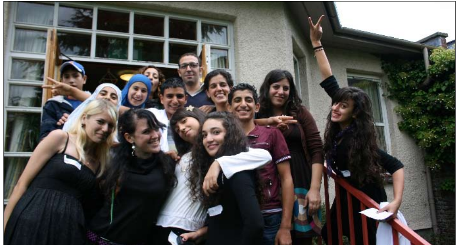
The Edinburgh Summer School July 2010

They had public meetings in Edinburgh and then in Liverpool.